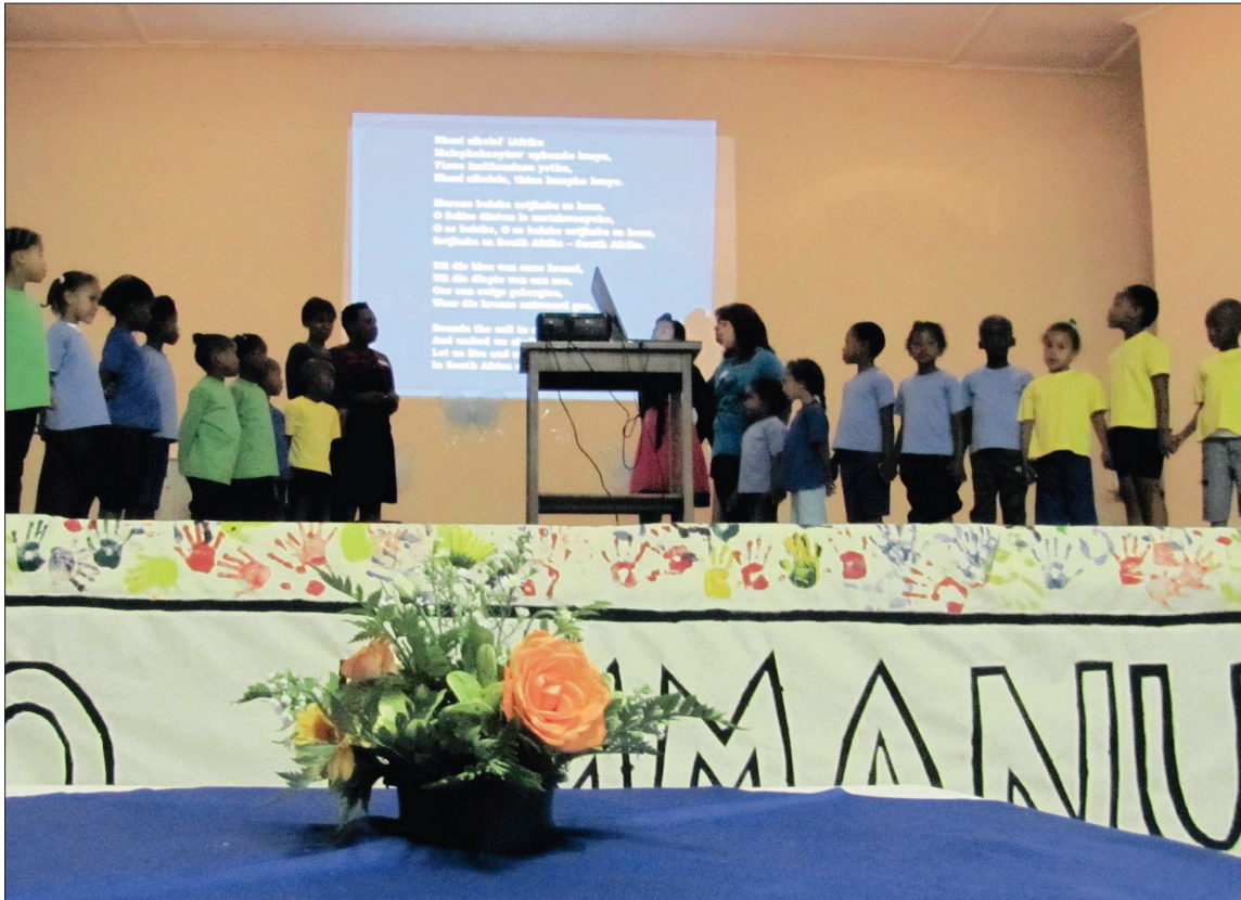
■ Grade R learners from Emanuel Educare sang the National Anthem.